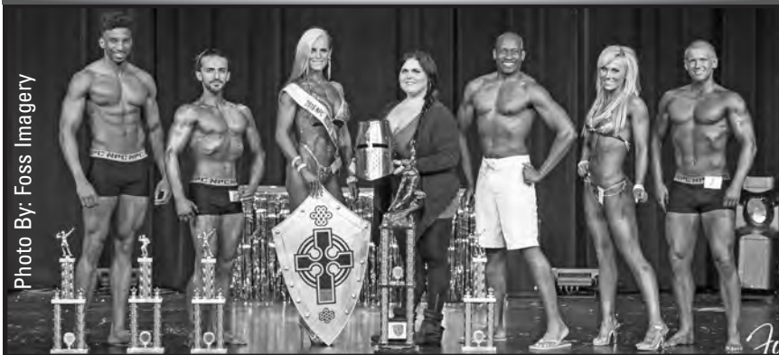
2016 NPC NOBLE WARRIOR TEAM CHAMPIONS