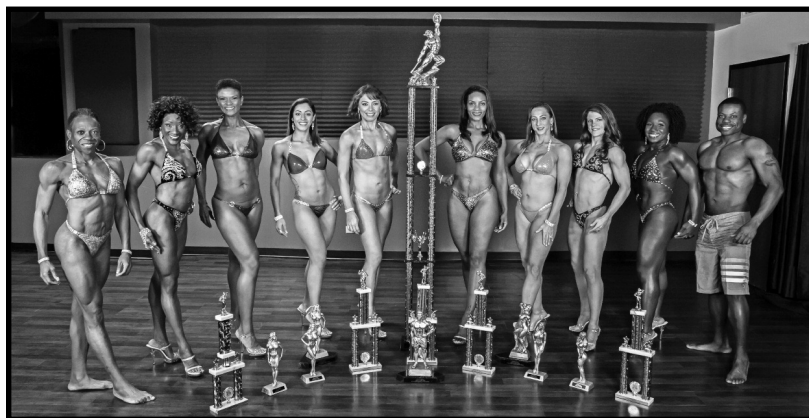
2015 NPC Natural Muscle Classic XXVIII Team Trophy Winner "Team Synergy" of Zion, IL.